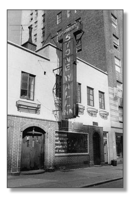
The Stonewall Inn in New York still exists today

Today, Stonewall also focuses on improving services and experiences for LGB people. You can find out more about this at <a href="https://www.stonewall.org.uk">www.stonewall.org.uk</a>.