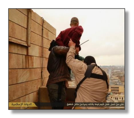
ISIS are still known to execute 'sexual deviant' men, often by throwing them off tall buildings

Believe it or not, homosexuality was not decriminalised in England and Wales until 1967. Even worse than this it wasn't until 1992 that the World Health Organisation declared that, 'homosexuality is no longer an illness'. As of May 2012 seventy eight countries still have legislation criminalising same-sex consensual acts between adults and carries penalties up to and including the death penalty.